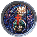
Worthing Baptist Church